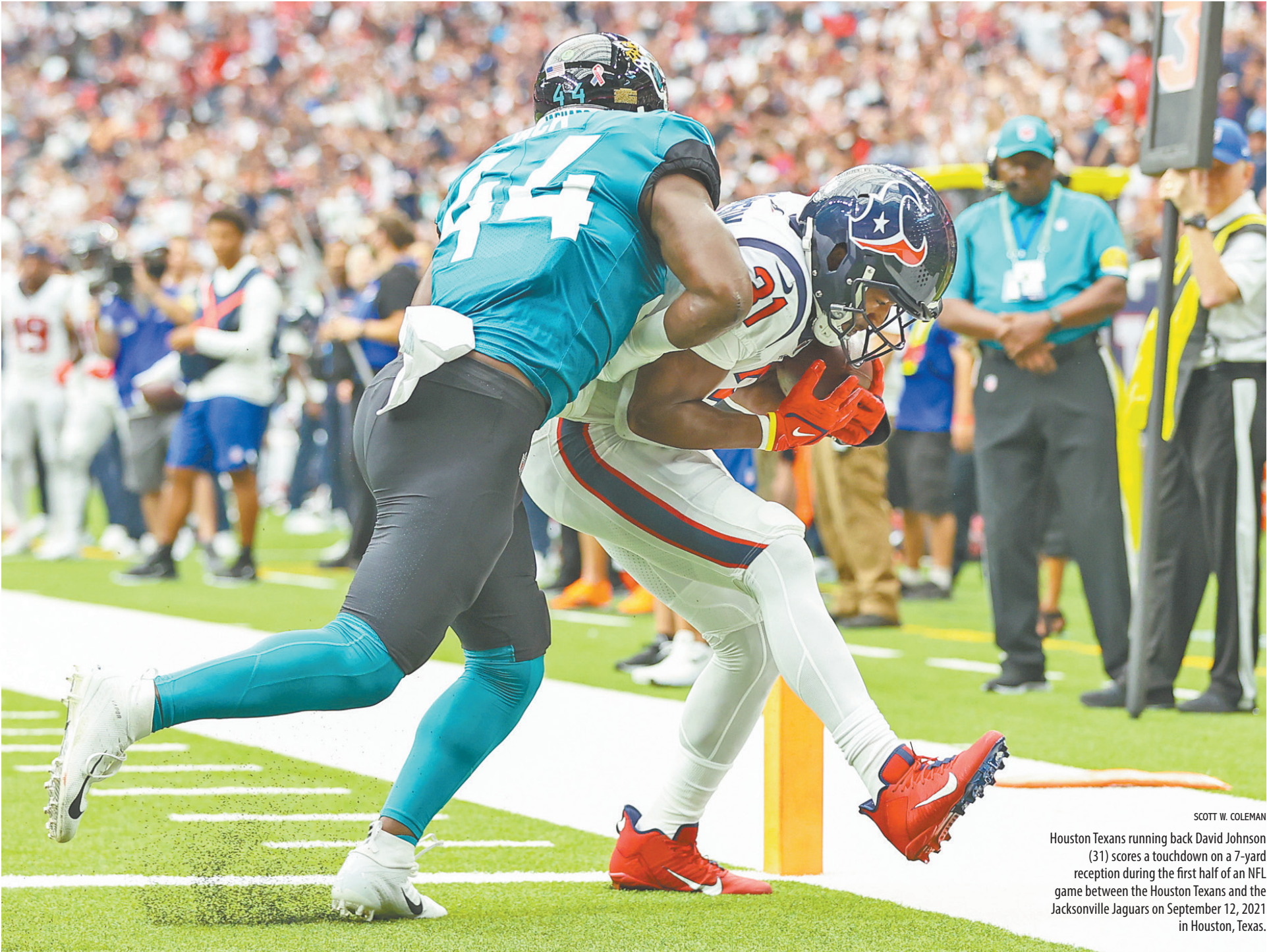
Houston Texans running back David Johnson (31) scores a touchdown on a 7-yard reception during the first half of an NFL game between the Houston Texans and the Jacksonville Jaguars on September 12, 2021 in Houston, Texas.