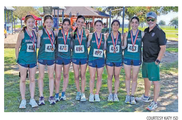
The Mayde Creek girls finished third at the District 19-6A meet.