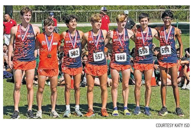
The Seven Lakes boys finished third at the District 19-6A meet.

The Katy girls finished in first place and the Katy boys finished in second place at the District 19-6A meet.