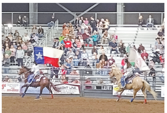
The Katy Cowgirls group opened Thursday night's Katy Rodeo with the running of the colors, presenting the U.S. and Texas flags.