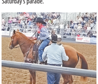
A young cowpoke receives assistance at Thursday night's Katy Rodeo.