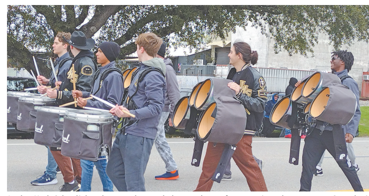
Jordan High School's band received second place in the performance/march category in Saturday's rodeo parade.