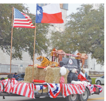
Winning first place in the "organization" category is Katy High School Alumni Association, which exemplified the red, white and blue theme of Saturday's parade.